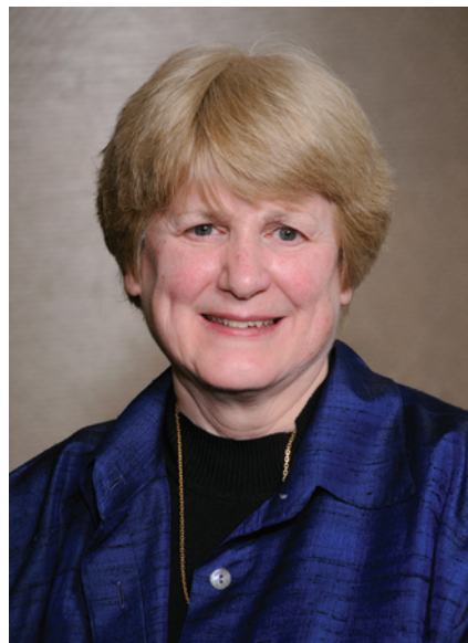
Figure 1. Mary-Claire King is the winner of the 2014 Lasker-Koshland Special Achievement Award in Medical Science for bold and imaginative contributions to medical science and society. Her achievements include the discovery of the relationship between BRCA1 and a hereditary form of breast cancer and the use of genetics to reunite missing persons with their families.